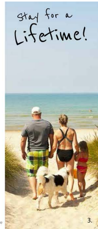
Front Cover Photo Credit: Trevor Crowe

Here are 25 Things to know about building a new life in The County.